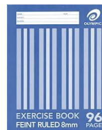
Exercise Book Sample only ~