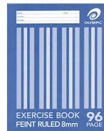
Exercise Book ~ Sample only ~