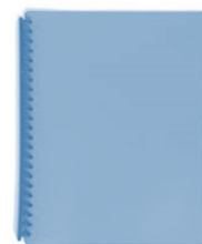
A4 Display Books