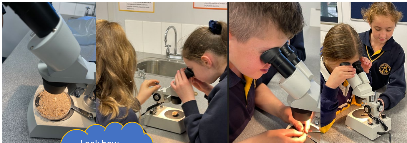
4A checking out rocks under the microscope in Science.

Look how beautiful sand looks when magnified!