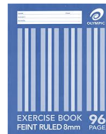
Exercise Book ~ Sample only ~