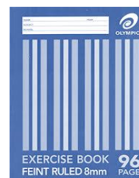
Exercise Book ~ Sample only ~