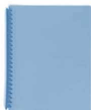
A4 Display Books