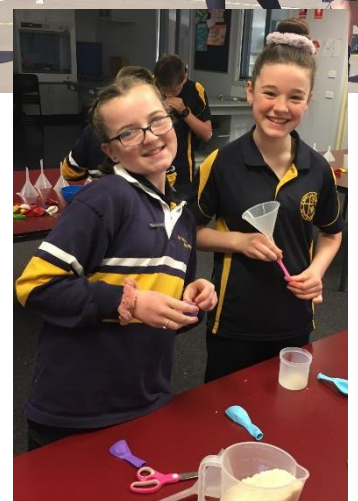
Photo Gallery: https://www.smseymour.catholic.edu.au/whats-on/galleries/