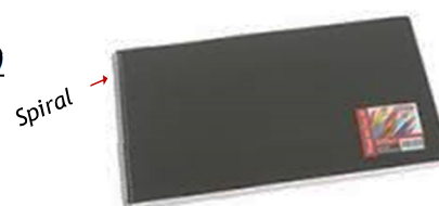
A3 Visual Diary