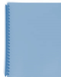
A4 Display Books