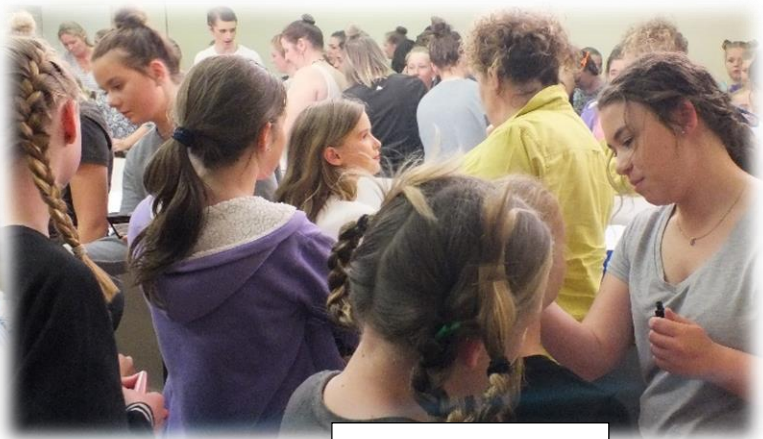
The Make-up Team