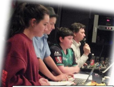
Sound & Lighting Crew