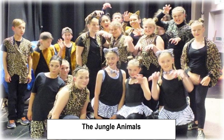
The Jungle Animals