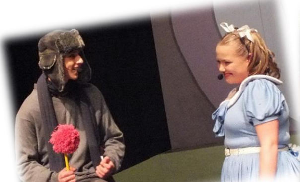
All For You